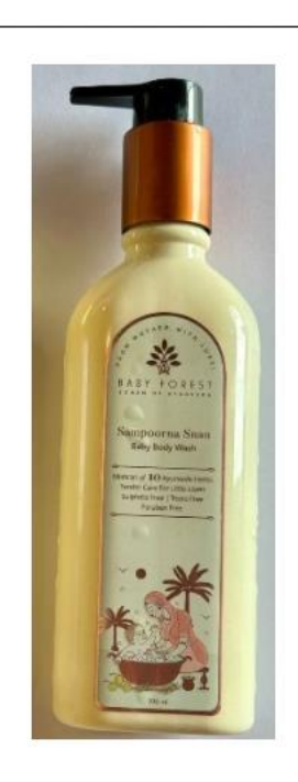
Bottle back view