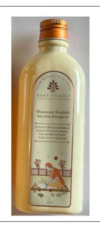
Bottle back view